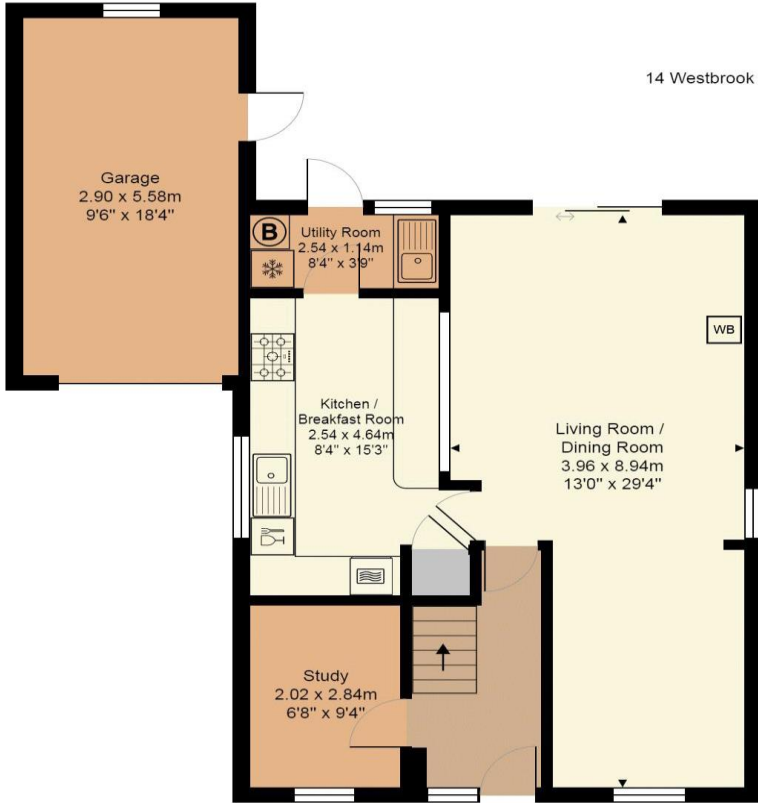
Ground Floor Area: 76.1 m 2 ... 819 ft 2