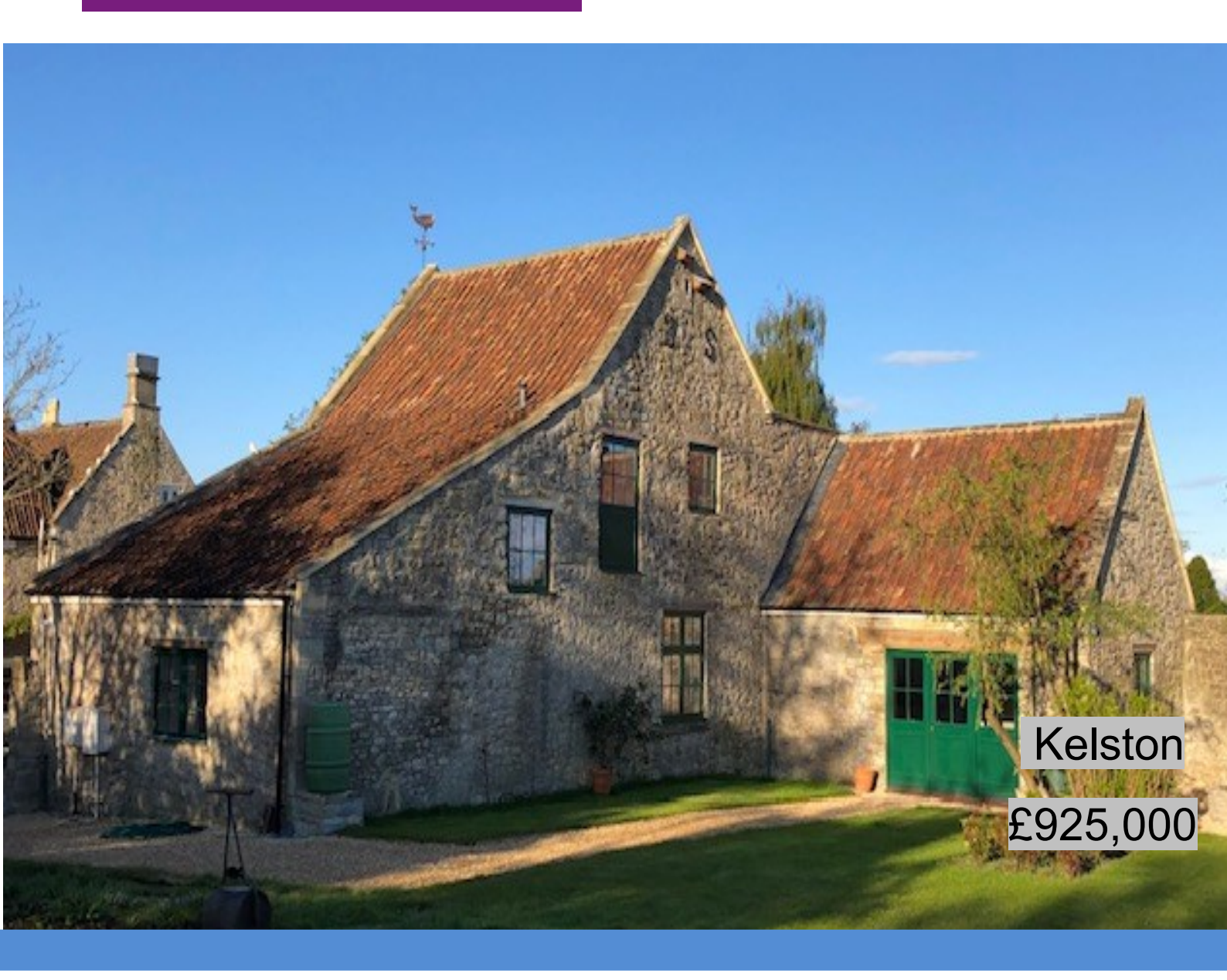
A Well Appointed, Spacious, Two Storey House. Popular Village Location. EPC Grade C