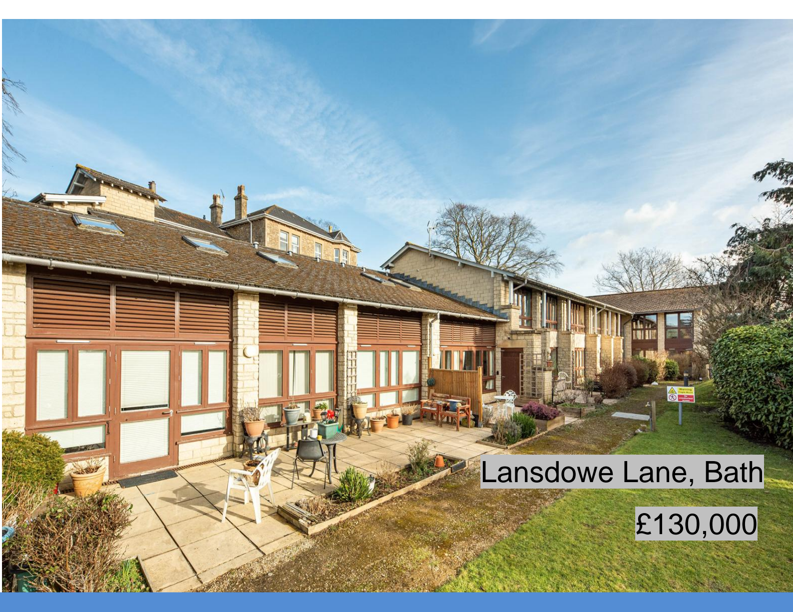
One Bedroom Retirement Apartment. Very Popular. EPC Grade D.