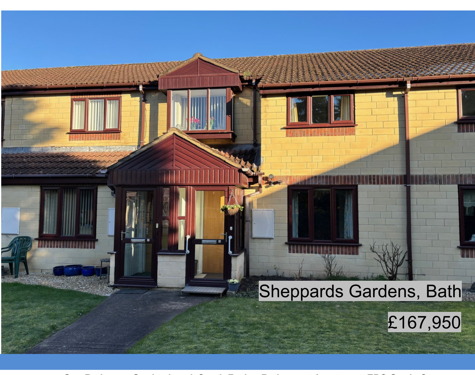
One Bedroom, Garden Level, South Facing Retirement Apartment. EPC Grade C